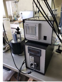
For piezoelectric constants of d_{33} , d_{31} , d_{15} modes