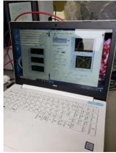
Brand-new installed. For measurements of both electric polarization and piezo-strain vs. external applied electric field.