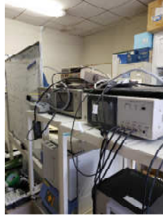
For Curie points.