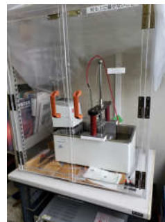
For polarizing samples.