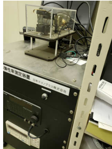
For Young's moduli.